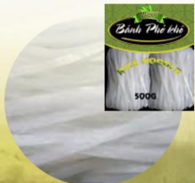
Rice Noodle BÁNH PHỞ