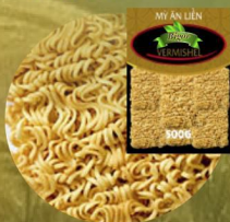
Noodle MỖ ẮN LIỀN