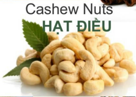
Cashew Nuts HẠT ĐIỀU