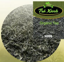
Green Tea TRÀ XANH