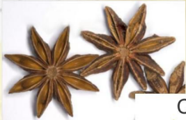
Star aniseed HOA HÒI

Delivering Best Performance Of Vegetable Processing