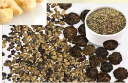
Black pepper HẠT TIÊU