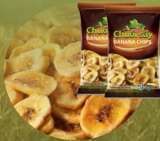
Grilled Bananas CHUỐI SẤY

Established in 1994, we are prime manufacturers suppliers of tropical products for domestic and oversea markets.