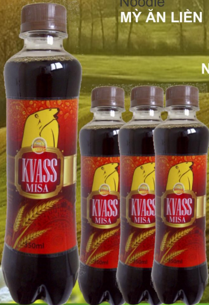
NƯỚC GIẢI KHÁT kvas MISA

The company is continuously working with the innovative and modern processing, packing and delivery tools to retain its current esteemed customers.